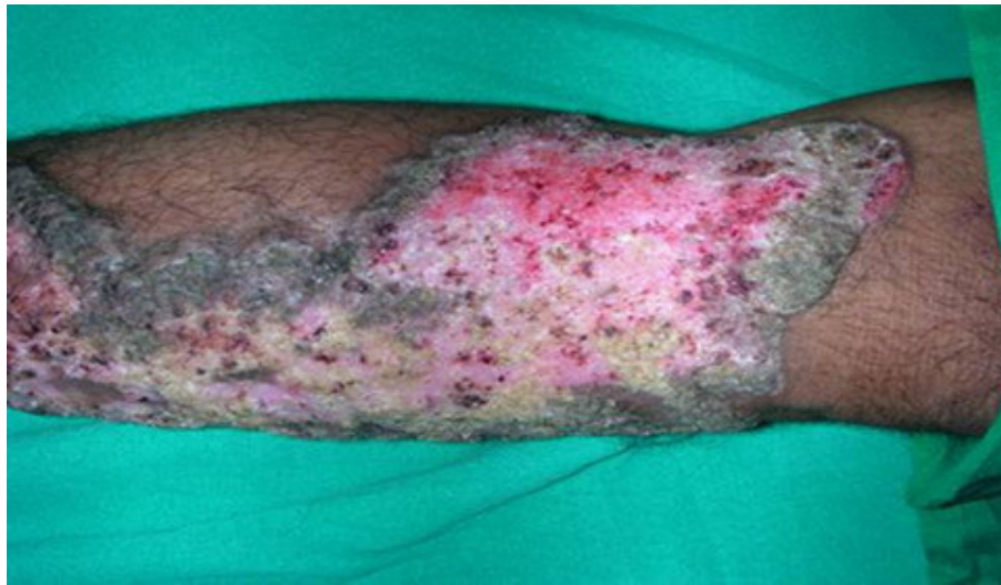
Fig 1: Verrucous plaques with hyperpigmented well defined irregular raised margins.

carcinoma) or chromoblastomycosis with SCC was made. Wedge biopsy from the fungating mass showed squamous cell carcinoma infiltrating into the stroma, well developed keratin pearls and squamous epithelial cells with large hyperchromatic irregular nuclei, consistent with the diagnosis of squamous cell carcinoma ( Figure 2 ). Punch biopsy from a plaque showed granulomas in the mid-dermis of different sizes, consistent with lupus vulgaris ( Figure 3 ). Mountoux test showed induration of 20 mm in diameter. Fungal cultures and KOH smear were negative. Chest x-ray and other laboratory investigations including complete blood count, random blood sugar and renal function tests were within normal limits. Based on the clinical and the histopathological features and the strong positive Mountoux test, diagnosis of lupus vulgaris with squamous cell carcinoma was made. CAT III antituberculous treatment including Isoniazide, Rifampicin, Pyrazinamide for 2 months and Isoniazide and Ethambutol for 6 months was advised. The patient was evaluated in the surgery department for amputation and wide field lymph node dissection.